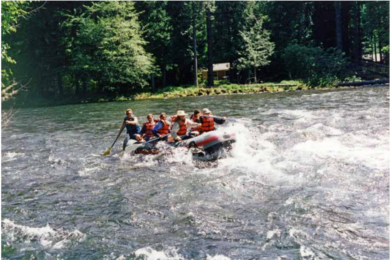
Participants rafting the McKenzie River with a guide, 1997