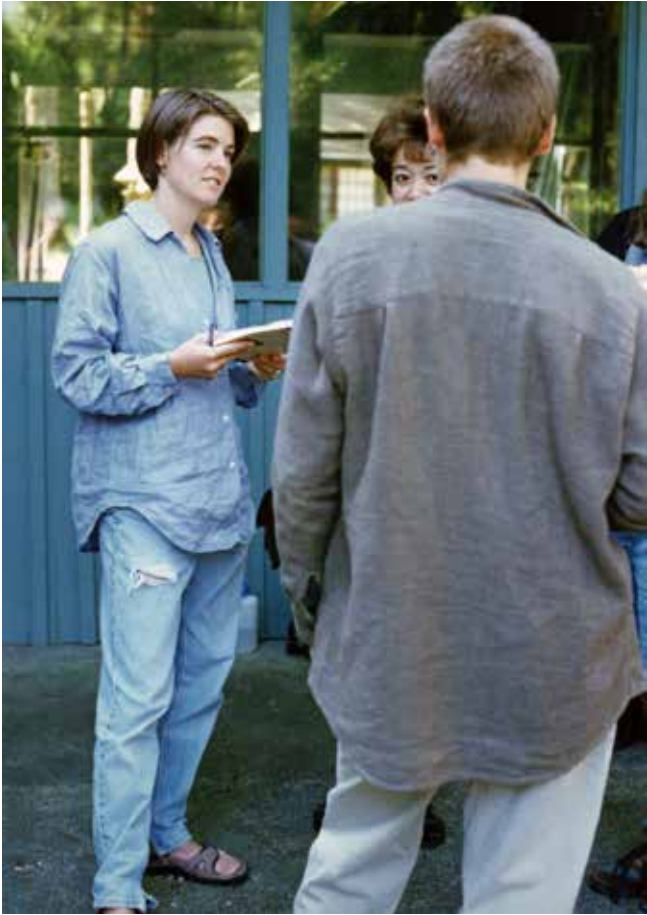
Participants conversing on the terrace, 1997