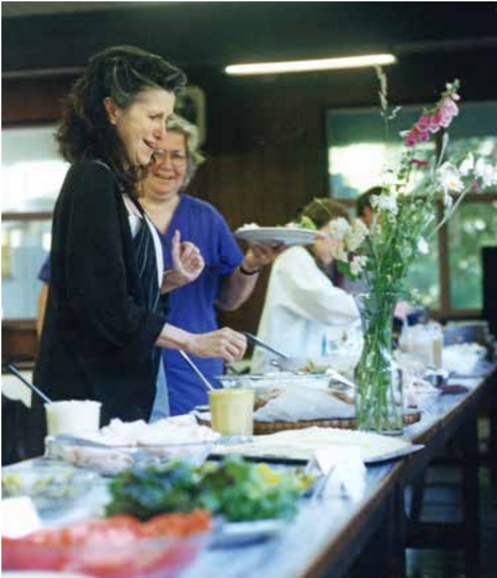
Participants at the lunch buffet, 1997