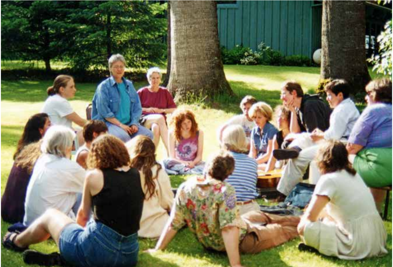
Afternoon discussion group, 1997