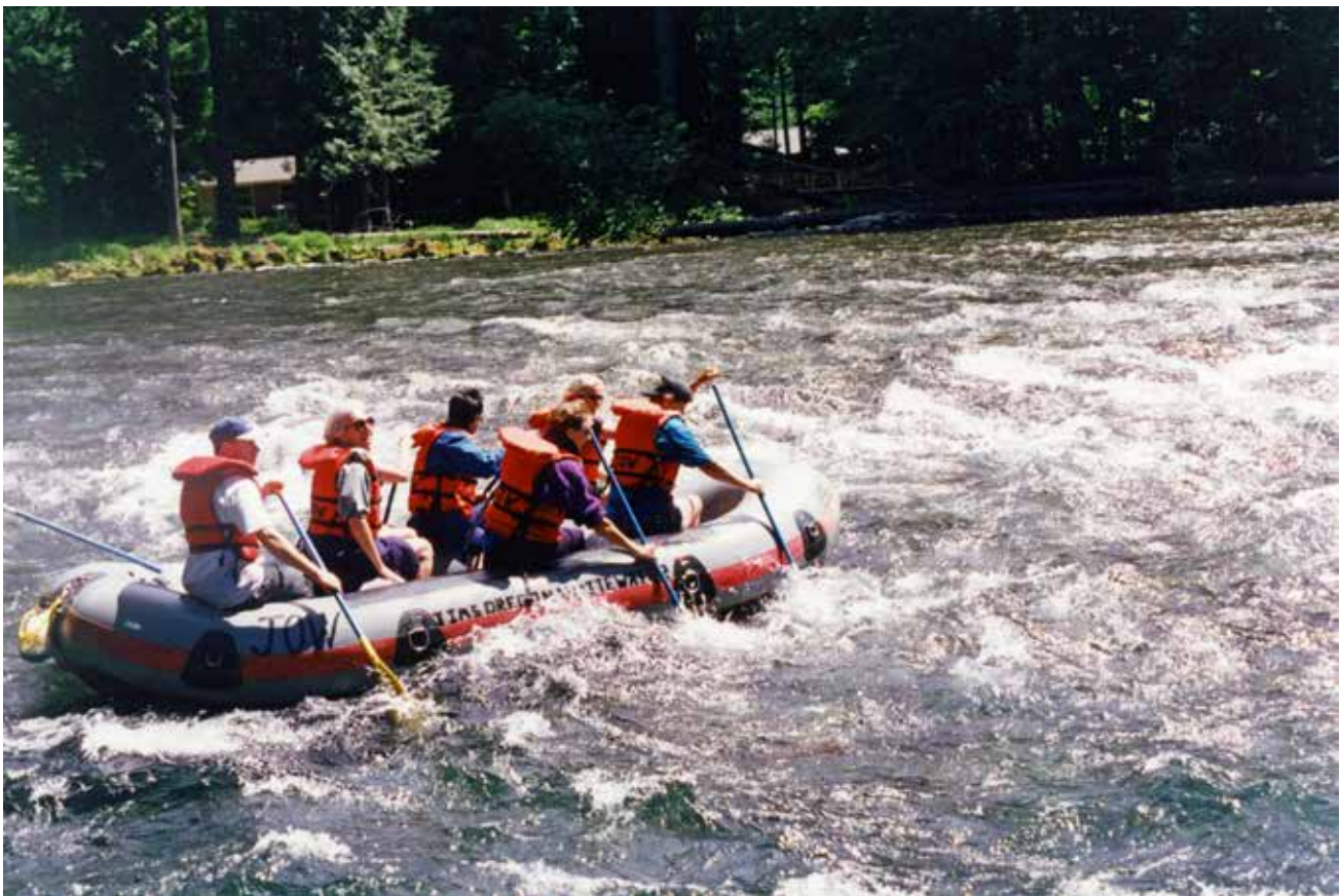
Participants rafting the McKenzie River with a guide, 1997