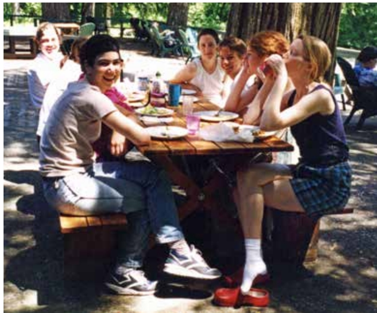
Above left: Participant, 1997