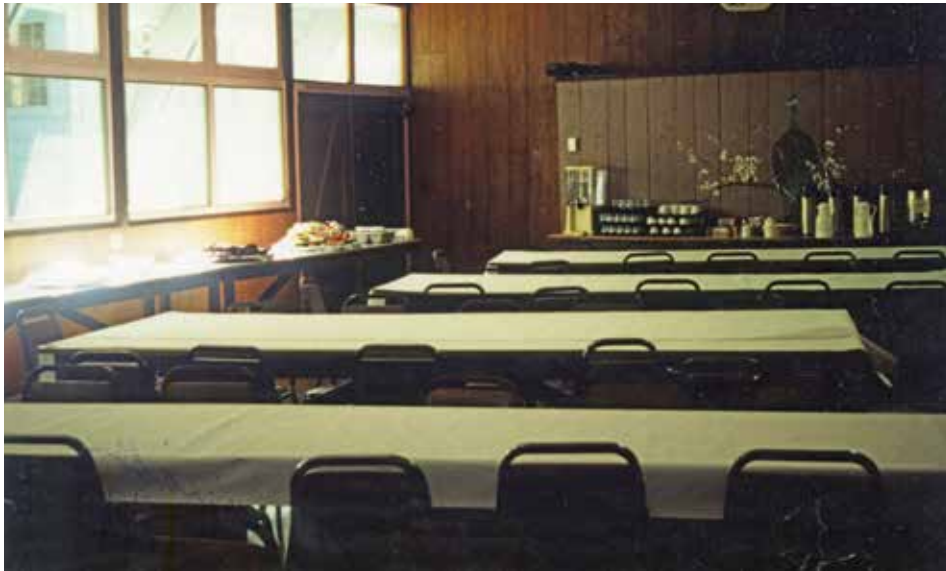
Left: Dining room in the late afternoon, with snacks and drinks, 1997