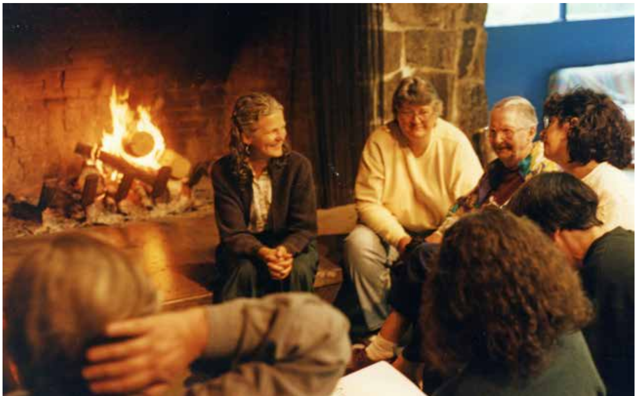
Class meeting in the lodge on a cool summer morning, 1997