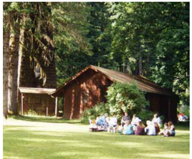
Below: Ad hoc critique group meeting on the lawn, 1997